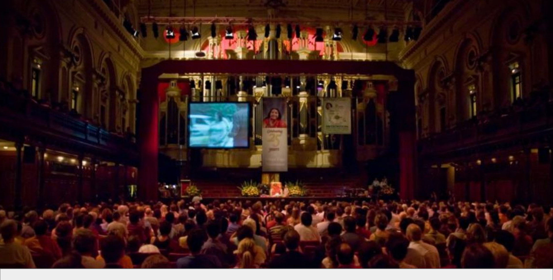
Transformation is Her Legacy